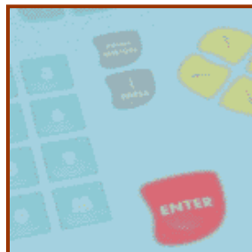
Sensitive digital keyboard Touch