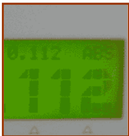
Display reading with enlarged easy visualization